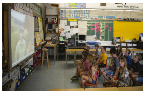
Cassell's Grade 2s connecting with Royal Botanical Gardens to learn about insects.