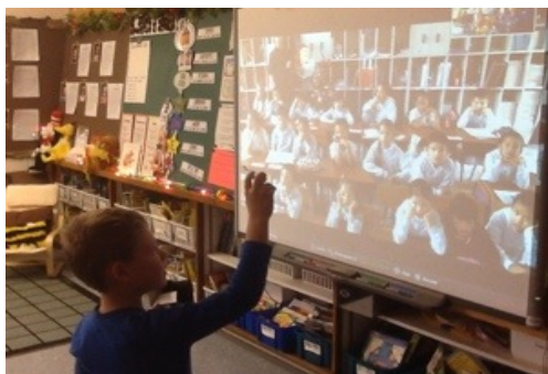
Cassell's Grade 2s connecting with kids in Colombia